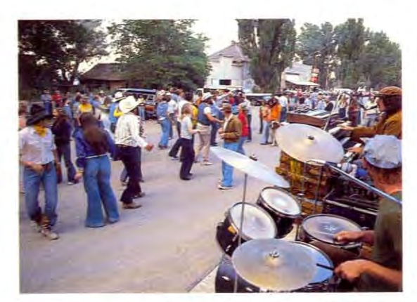
Evening dance at the volunteer fireman's barbecue, Paradisa Valley, Nevada. Forming around shared concerns (in this case, the need to protect the community from fire), voluntary associations can be rich centers of cultural production. (NV8-CF114-14) Photo by Carl Fleischhauer, June 18, 1978.

ent century the metaphor of the melting pot has been used to symbolize this transformative process. However, the metaphor suggests that it is the immigrants, not those already here, who must change in order to blend in with American life, and that these changes occur automatically. It suggests that cultural difference is an impurity to be refined away in the crucible of American experience. We no longer view cultural difference as a problem to be