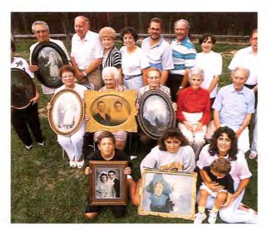
Assembled for a portrait, members of an Italian-American family in Pueblo, Colorado, express their continuing sense of community with their ancestors, producing a single image that metaphorically unites them. (IAW-KL-C086-17) Photo by Ken Light, July 8, 1990

In the United States, awareness of folklife has been heightened both by the presence of many cultural groups from all over the world and by the accelerated pace of change in the latter half of the twentieth century. However, the effort to conserve folklife should not be seen simply as an attempt to preserve vanishing ways of life. Rather, the American Folk-