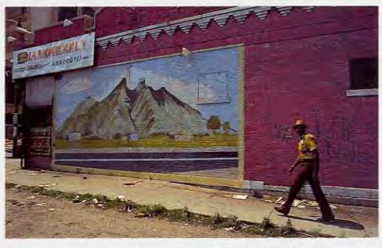
A wall mural on 26th Street In "Little Village," a predominantly Mexican section of Chicago. Nostalgla for an absent homeland may inspire immigrants to render distant landscapes more immediate through artful representations. (CH77-171-3) Photo by Jonas Dovydenas, August 13, 1977

The traditional knowledge and skills required to make a pie crust, plant a garden, arrange a birthday party, or turn a lathe are exchanged in the course of daily living and learned by imitation. It is not simply skills that are transferred in such interactions, but notions about the proper ways to be human at a particular time and place. Whether sung or told, enacted or crafted, traditions are the out-